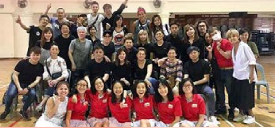
Organising Team with Hairstylists

Hair Catchers was a project by a group of 6 girls, trying to spread hope with what we have on us--hair! Our events included fundraising, talks and a hair donation drive in school. As Nanyang was turning 100, we hoped to celebrate this by cutting our hair to celebrate our heritage and to serve a good cause, manufacturing wigs for cancer patients. It was a beautiful and heartwarming event, seeing the Nanyang community sacrifice a little to give back to our community. We hope that this can inspire our schoolmates and let them know that they can make a difference in another's life too.