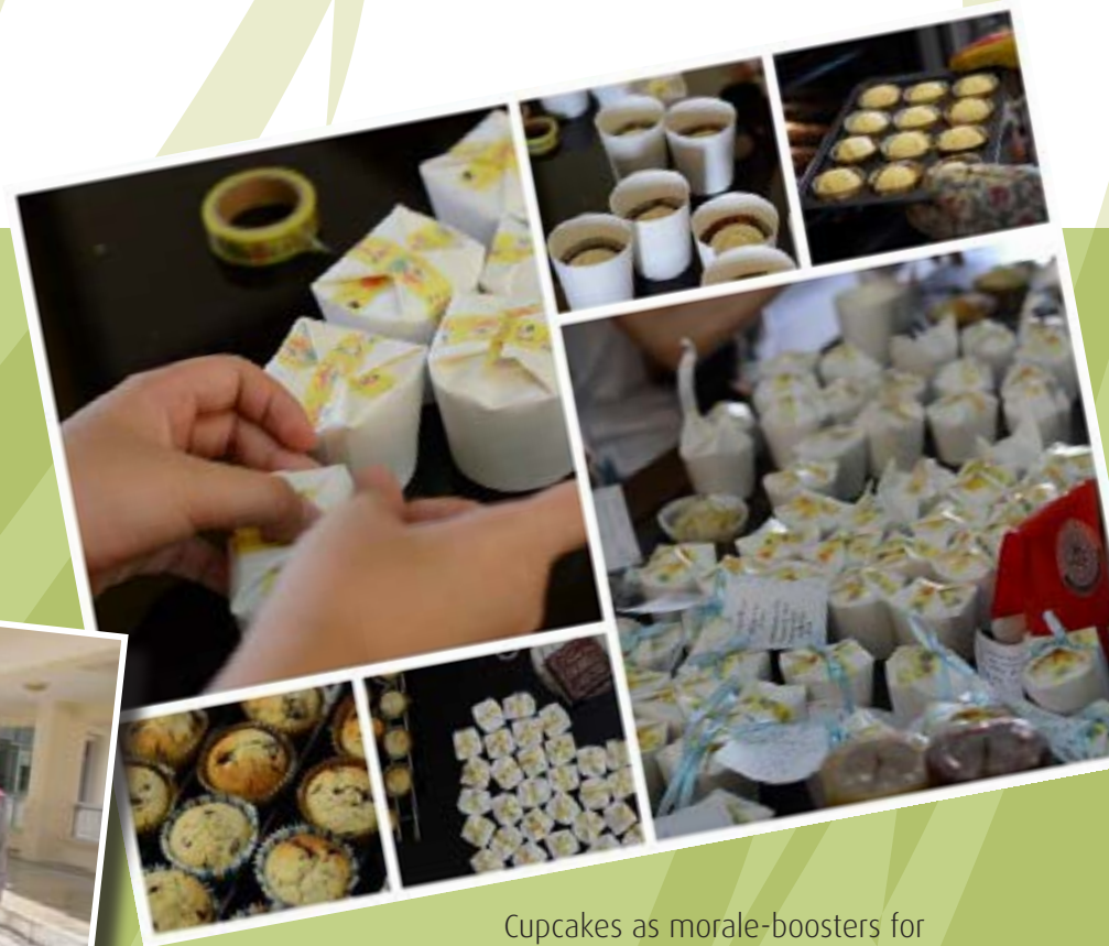
Cupcakes as morale-boosters for teachers, baked by students