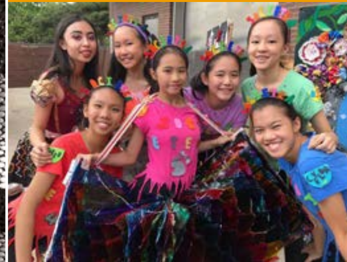
P5D2(Problem 5 Division 2) Problem 5 division 2 - 1 st runner up