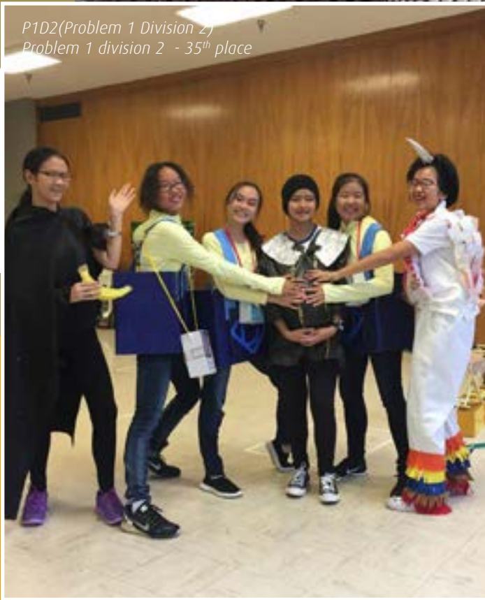
P1D2(Problem 1 Division 2) Problem 1 division 2 - 35 th place