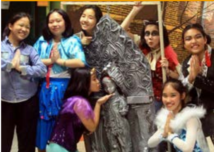
P3D2(Problem 3 Division 2) Problem 3 division 2 team A - 11 th place