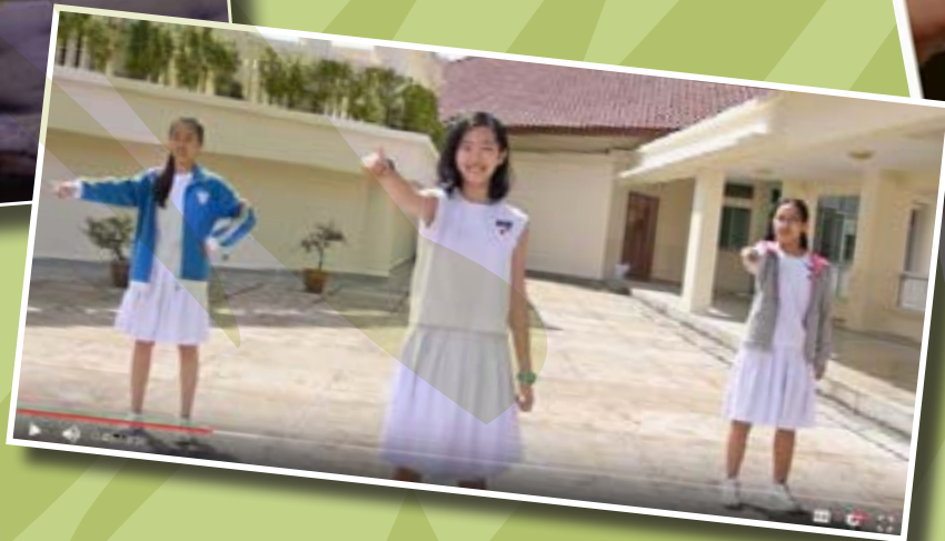
A music video of one of the songs in NY100 Sing