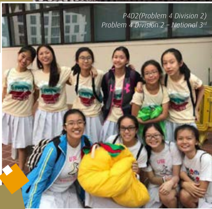
P4D2(Problem 4 Division 2) Problem 4 Division 2 - National 3 rd