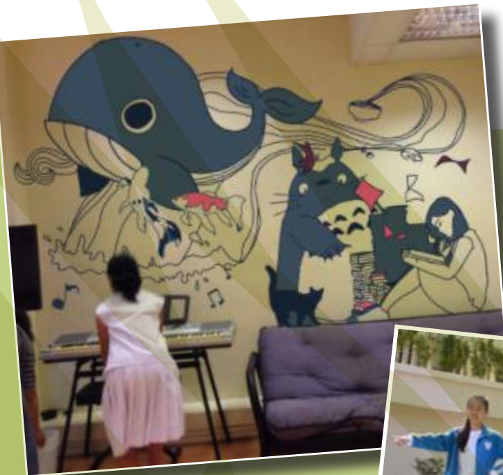
A mural painted in the Student Activities Centre