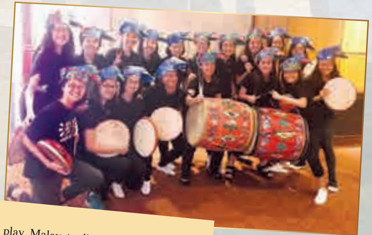
NYGH MSP students performing the traditional Malay gendang and kompong as part of a cultural showcase.

Acara ini telah dianjurkan oleh Sekolah Menengah Zhenghua untuk sekolah-sekolah kelompok CW6. Tema bagi acara tahun ini adalah 'Inilah Warisan Kita!'. Pelajar-pelajar daripada pelbagai sekolah yang terlibat telah mengadakan persembahan seperti tarian tradisional Melayu, persembahan kompong dan juga nyanyian. Pelajar-pelajar Menengah 4 Bahasa Melayu (Program Khas) juga telah membuat satu persembahan gendang dan kompong tradisional Melayu setelah menjalani satu program pengayaan budaya di sekolah.