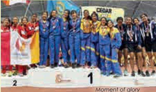
Moment of glory

Track and Field is more than just winning medals and it is definitely about the process, about the attitude that comes after each race and the experience. It's been an incredible journey competing for NYGH with the support of the school, peers and family. Four years in the sport has certainly been arduous, but they have been nothing short of "fulfilling".